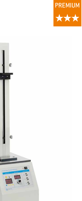
Motorised test stand incl. length measuring system LD