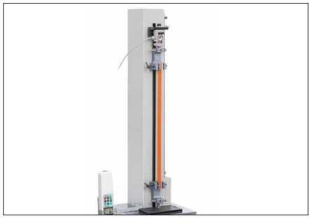
A wide range of application possibilities because of its large travelling distance