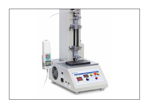
Solid and flexible fixing options for many clamps and accessories from the SAUTER product range, see Accessories