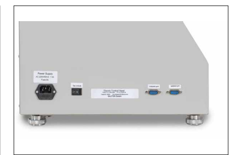
Interface for data transmission from the SAUTER FH measuring device and for controlling the test stand with SAUTER AFH software